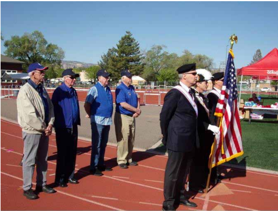
May 5, 2019 - Western Slope Regional Special Olympics

Knights from council 13621 and 1602 were the honor guard for the opening parade. A large turnout of athletes from all over the Western Slope participated in the events.