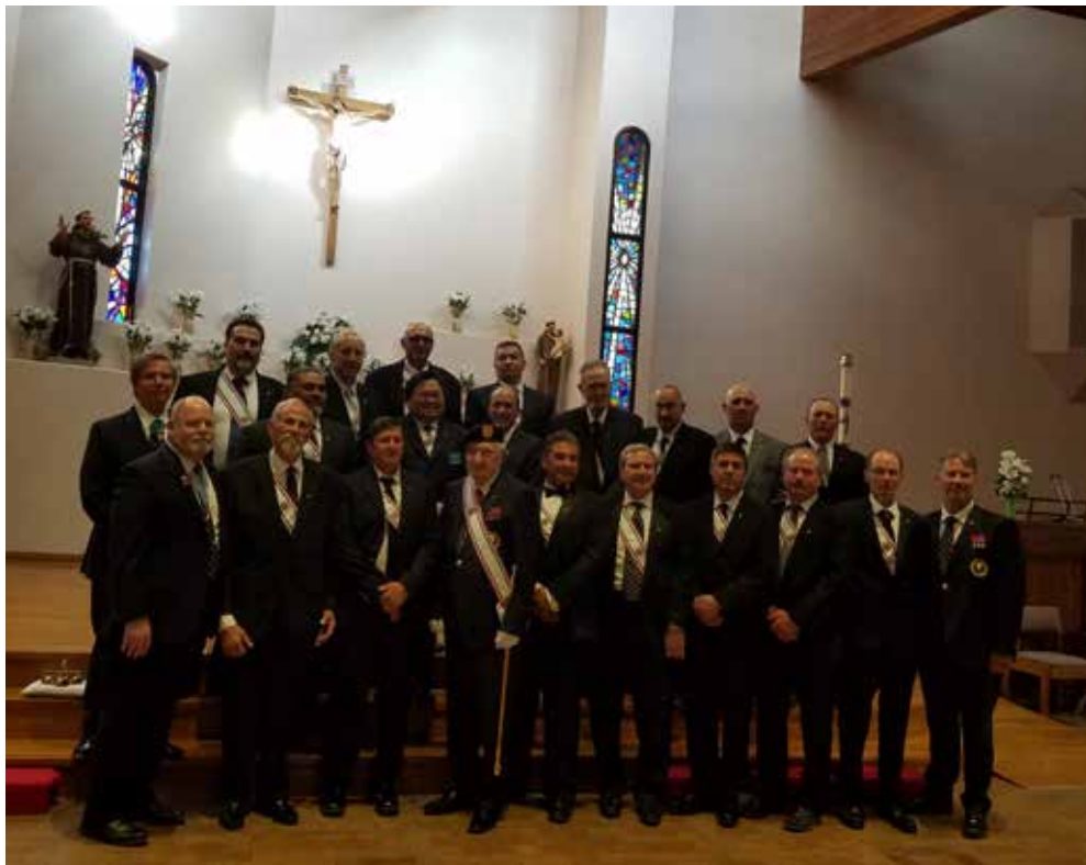
Pueblo Degree May 4, 2019